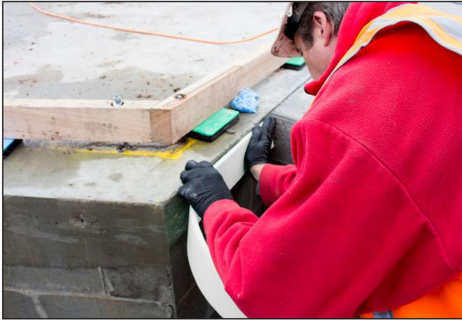
Greenzone Termite and Insect Barrier being installed at a commercial job site

Its easy joint applications and precast panel applications have proven to be of definite value to pest managers such as Glenn O'Sullivan from BG Pest Control.