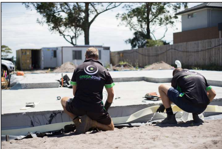
Greenzone being used where concrete paving abuts external concrete wall panels

Pest managers interested in becoming a Greenzone accredited installer can visit the Greenzone website.